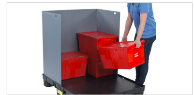
Multi-piece sleeves for operator access available