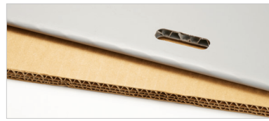
Tri-Clone vs. Paper: Rounded edge seal with smooth, cleanable surface