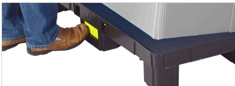
Proprietary pallet latch automatically locks sleeve to pallet. Release is foot operated from standing position