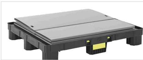
Sleeve collapses for efficient nesting for return trip