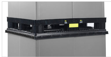
Secure stacking feature