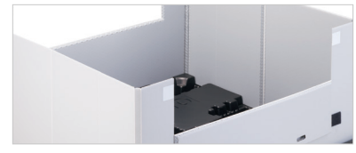
Optional access doors with Velcro latching