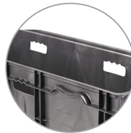
Optional handle holes for better grip