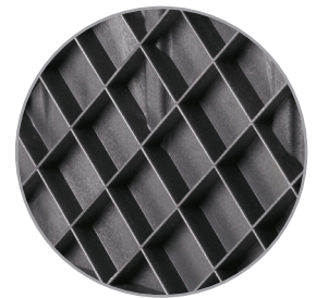
Reinforced bottom (R) is available