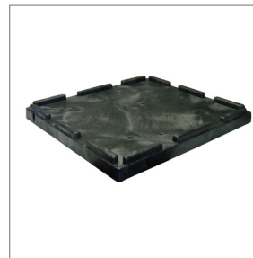
Compatible with CKD 48x45