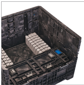
Door collapse with dunnage in the bottom storage